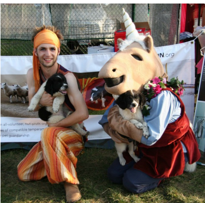
Above: Participants of Ren Fest stop to play with BCR dogs